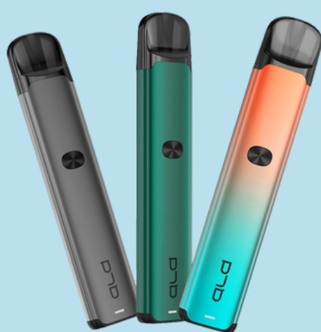
ALD 2 IN 1 REFILLABLE OPEN AND CLOSED VAPE