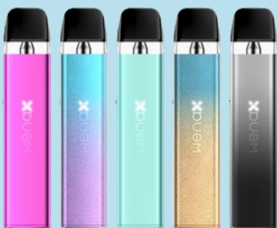
GEEKVAPE WENAX Q MINI