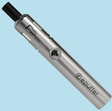
EPUFFER TITAN X