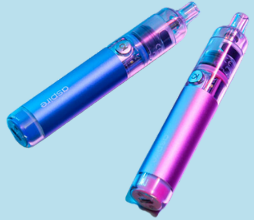
SMOK VAPE PEN