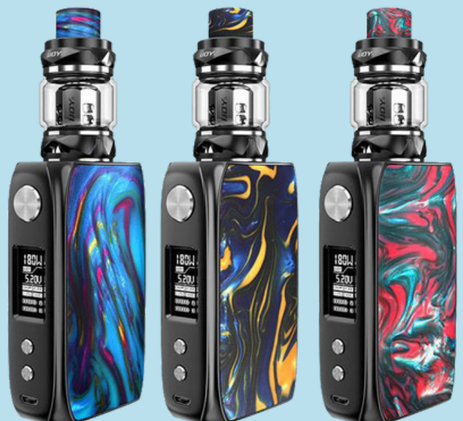
IJOY SHOGUN UNIV 180W BOX MOD