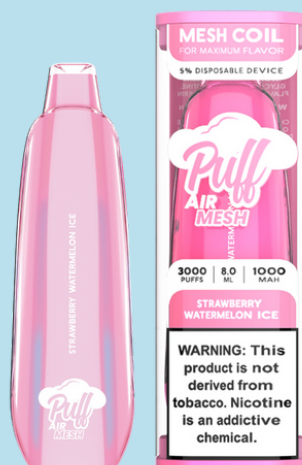
AIR MESH DISPOSABLE VAPE- 3000 PUFFS