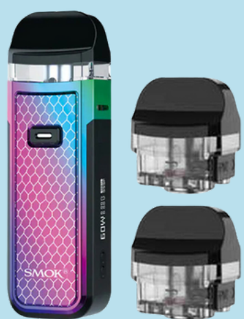
SMOK NOVA 4