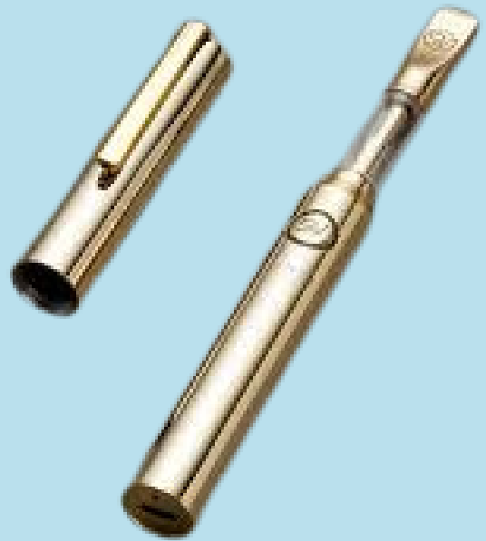
GOLD LUXURY VAPE PEN