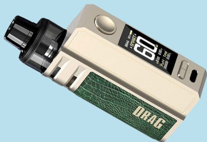
VOOPOO DRAG 4 BOX MOD