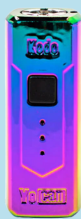
YOCAN KODO BOX MOD