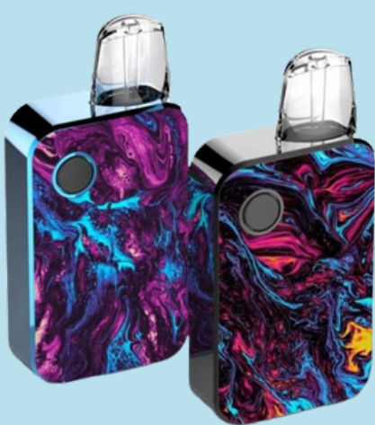
380 MAH BOX MOD