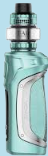
SMOK MAG SOLO BOX MOD VAPE