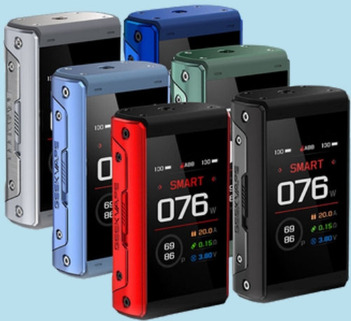
GEEKVAPE T200 (AEGIS TOUCH) BOX MOD