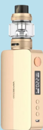
VAPRESSO GEN X 220W TC VW BOX MOD