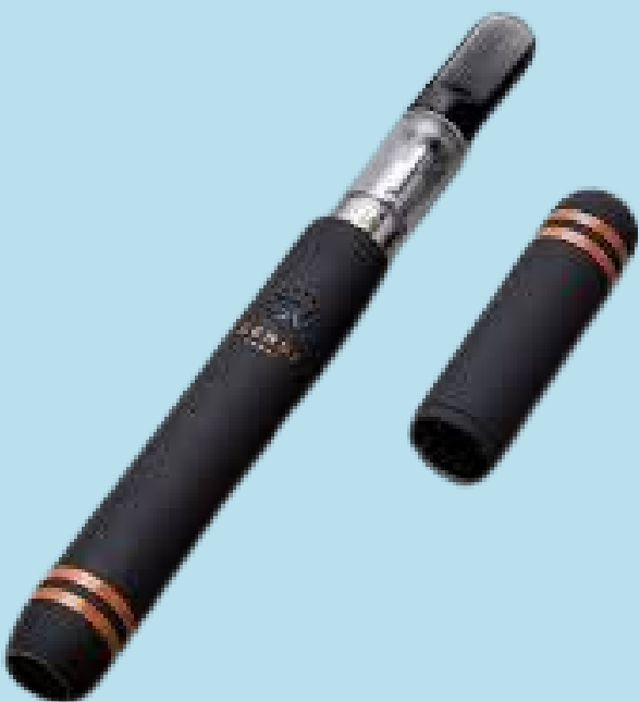
COOL GRAY LUXURY VAPE PEN