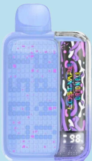
LOST VAPE ORION BAR 10000 DISPOSABLE VAPE 10K PUFFS