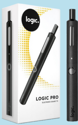
LOGIC PRO VAPE PEN