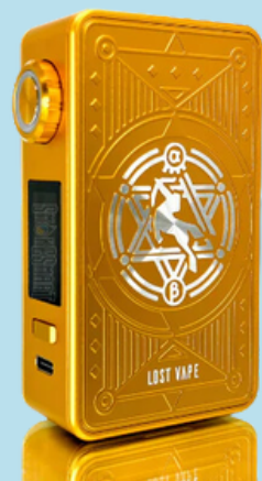
LOST VAPE CENTAURUS M200 200W BOX MOD