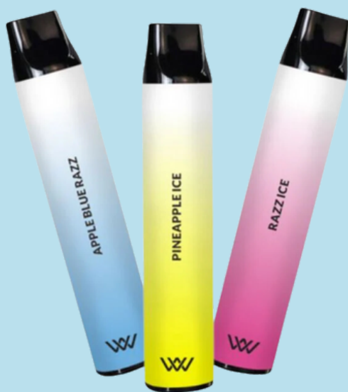
WELL VERSED DISPOSABLE VAPE 30000 PUFFS