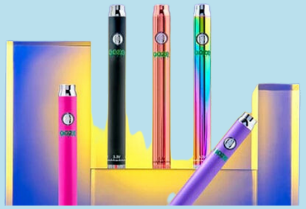
EVO D VAPE PEN E CIG EVOD VAPORIZER PENS BATTERY 11 COLORS 900MAH