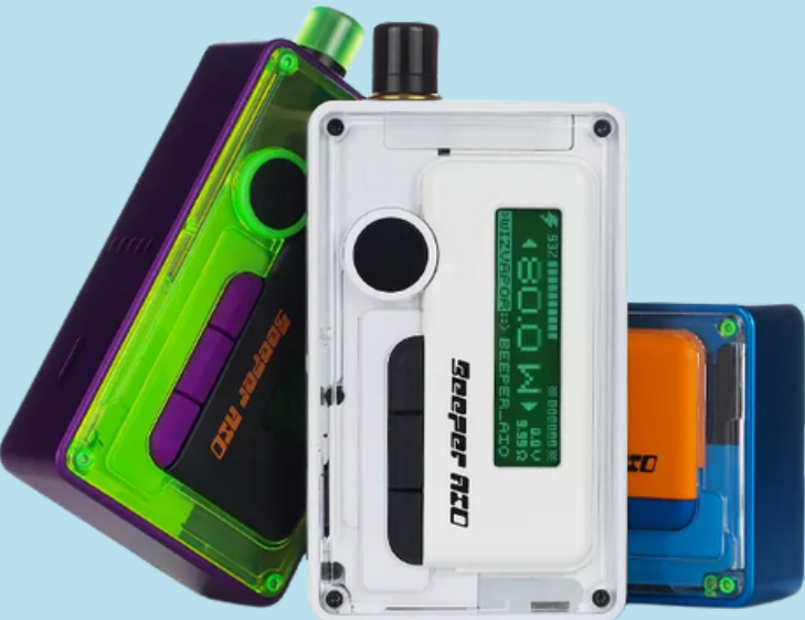
WIZVAPOR BEEPER AIO BOX MOD