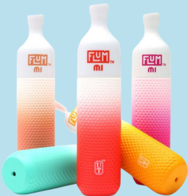
FLUM & FLOAT DISPOABLE VAPE- SOLD BY HUFF AND PUFFERS