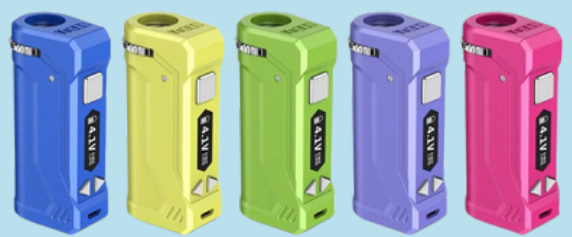
YOCAN UNI PRO BOX MOD