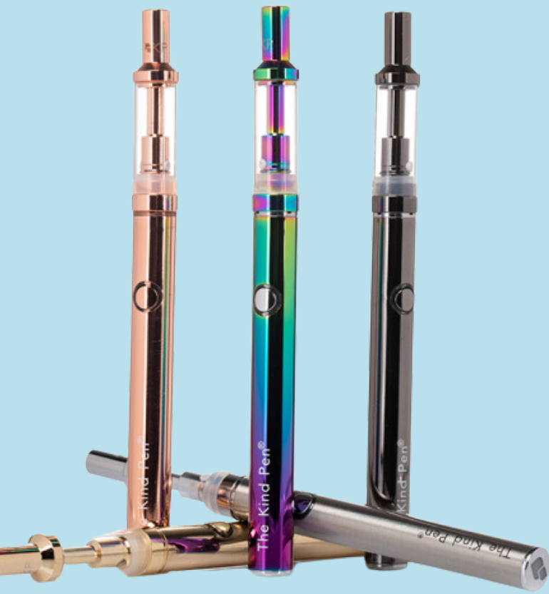
THE KIND PEN VAPE